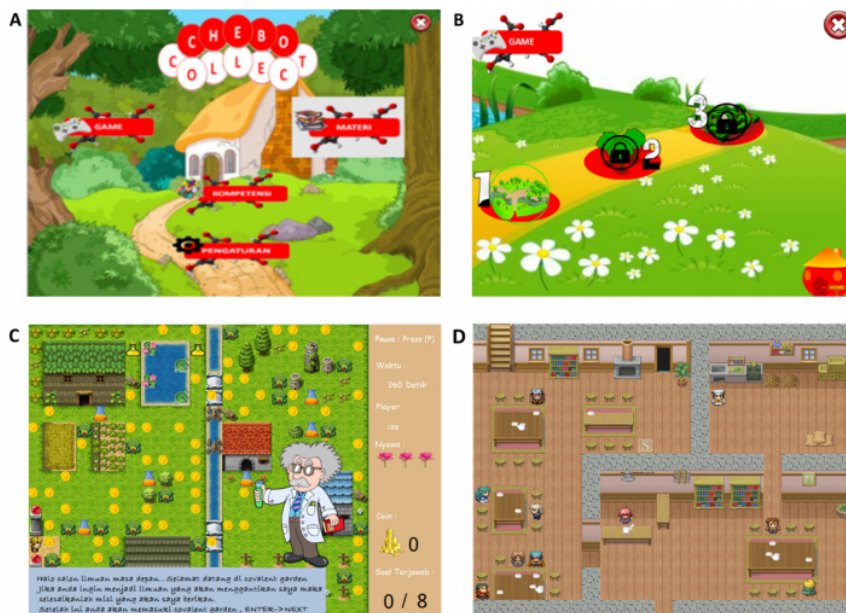
Figure 1. The Chebo collect game design. A. Main menu. B. Level select. C. Level 1, the gardens. D. The player looking for literature in the game

to the challenge in the form of texts, figures, and videos. After completing the challenge, the player's score will be displayed. The teaching materials in the game are covalent bonds, Lewis' Theory, coordination covalent bonds, and polar and non-polar substances (Figure 1).